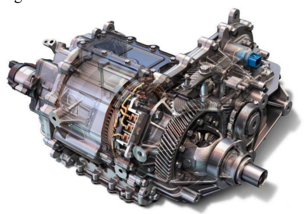
Fig.1 Schematic Diagram of an Ac Motor

AC motors are motors that use alternating current, and are classified into two types: asynchronous motors and synchronous motors. Among them, synchronous motors are the most widely used in automobiles. Synchronous motors are widely used as power sources for automobiles due to their excellent power consumption efficiency, low noise, high output density, and favorable constant-speed rotation due to their structure.